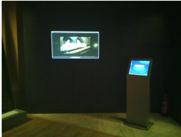
Fig. 4 - Example of Touch Screens, Taken by Sayed Abuelfadl.

immersive and memorable learning experience. (N. M., 2016).