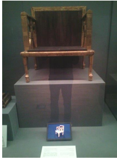
Fig. 2 - Movie of the Reconstruction of the Chair of Queen Hetep-Heres.