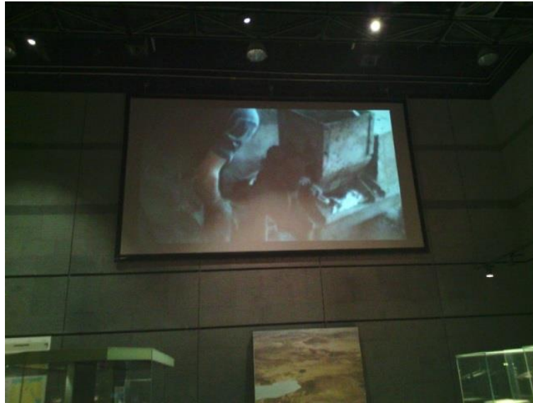
Fig. 5 - Example of Large Screen.

One of the main technology used in the temporary exhibition are 4 large screens show us four movies one for each handicraft at the top of one of the gallery sides. This kind of movies is a mix between the old and the new during the meeting with a group of skilled manufacturers in the field of their industries. These kinds of movies give the visitors a brief information about each manufacturer and give them the time to think in the continuity of the handicraft trough the ages.