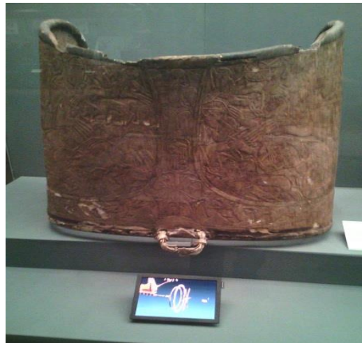
Fig. 3 - Movie of Reconstruction of the Egyptian Chariot, Taken by Sayed Abuelfadl.

In this video on a small tablet also show us a reconstruction of the Egyptian chariot, how it was made and how many pieces was used in it. In ancient Egyptian society chariotry stood as an independent unit in the King's military force. Chariots were first introduced as a weapon in Egypt by the Hyksos in the 16th century BC. The Egyptians developed their own design of the chariot. (N. M., 2016).